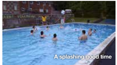
A splashing good time

Every year the PB staff take our teenagers on a weekend of fun away from ward life to Avon Tyrell Activity Centre in the New Forest.