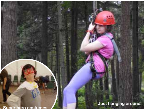
Just hanging around!