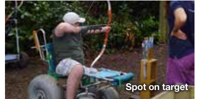
Spot on target