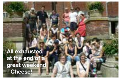
All exhausted at the end of a great weekend - Cheese!